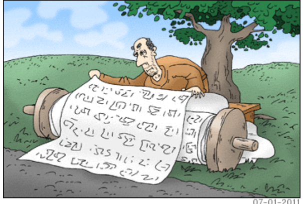
THIS LARGE PRINT EDITION WAS WORKING OUT PRETTY WELL